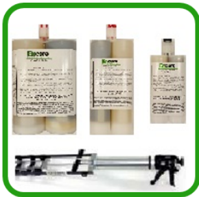
200ml, 600ml, 1500ml Cartridges and Applicators

Encore's high yielding compound is offered in three different size cartridges, 5 gallon pails and 125 and 250 gallon totes. Material has a one year shelf life when sealed and stored properly. Cartridge application spike hole yield: 12 holes per 200ml, 35 holes per 600ml, and 85 holes per 1500ml spike holes. Average gallon yield: 320 spike holes per gallon in pails and totes.