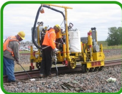
Walk-behind HV Epoxy Machine

Encore has a variety of equipment to meet your production needs. Including ride-on, walk-behind and smaller skid mounted equipment to fit in the back of a high-rail vehicle. Encore also designs application systems for any concrete tie plant process.