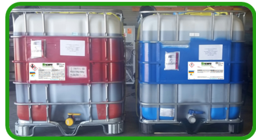
115 and 250 Gallon Totes