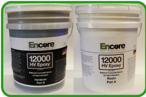
5 Gallon HV Epoxy Pails

Encore's HV Epoxy comes in five gallon pails. SpeedSet is packaged in 5 gallon pails and 115 gallon totes.