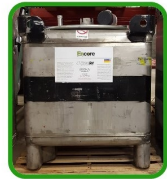
115 Gallon SpeedSet Tote