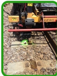
SpeedSet Add-on for Ride-on Tie Plugger