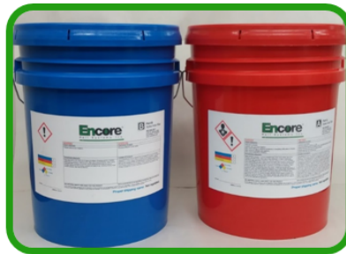
5 Gallon Pails