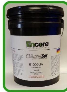
5 Gallon SpeedSet Pail