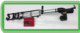
600ml Cordless Powered Applicator

Increase operator comfort and greatly reduce costs with our line of 600ml applicators and 1:1 ratio expanding plugging compound for wood tie repair. All of our applicators are manufactured with high strength steel and are a rugged reusable applicator.