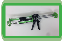
600ml Short Manual Applicator