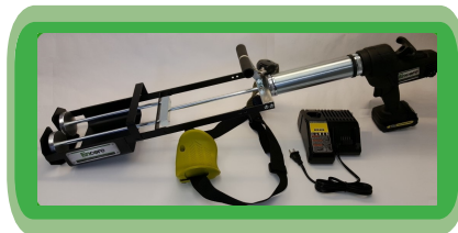
1500ml Cordless Powered Applicator

Encore's 1500ml cartridges are manufactured for larger manual tie plugging jobs. The 1500ml cartridge can plug up to 85 holes, allowing operators to change cartridges less frequently and keep up production. 1500ml cartridges allow for more chemical in each case to reduce the number of cases needed which reduces freight costs as well.