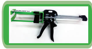
200ml Manual Applicator

The 200ml cartridge is designed for small tie plugging jobs such as plugging around a thermite weld. The 200ml applicator is lightweight and compact, and designed to fit in a welders tool kit.